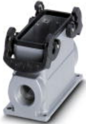
The figure shows the article as type B 24

HEAVYCON box mounting base B16, with double locking latch, height 84 mm, with support 1xM25